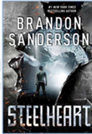
Steelheart by Brandon Sanderson

Steelheart , by Brian Sanderson, is set in Newcago, Illinois. The protagonist, David, is the lone survivor of a mass murder from an "Epic" named Steelheart. Epics are sort of like superheroes: they are humans that have developed powers like invincibility, flight, or creating energy. Steelheart has taken over Newcago and is terrorizing the citizens that are challenging his authority. David joins the Reckoners, a rebel group that kills Epics and has a plan to take down Steelheart once and for all. David has been preparing for this moment all of his life ever since his father got killed in the murder at the bank. The Reckoners don't think that they can do it since Steelheart keeps his weakness hidden, but David is determined to find it out and stop him and his rule over Newcago for good. 416 pages