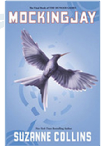
Mockingjay by Suzanne Collins

In the third and final installment of the Hunger Games series, Katniss Everdeen wakes up confused and finds out that she has been taken to District 13--surprised to discover that 13 has survived. She learns from the president of District 13 that all of the districts are at war with The Capitol, and she is enraged. After talking with multiple people she cares about, she agrees to become the symbol of the rebellion. She will become the Mockingjay. Knowing that this will be a risky task, she does it to show the people of Panem that The Capitol needs to be stopped and she will do everything she can to make sure that they no longer control the Districts. 390 pages